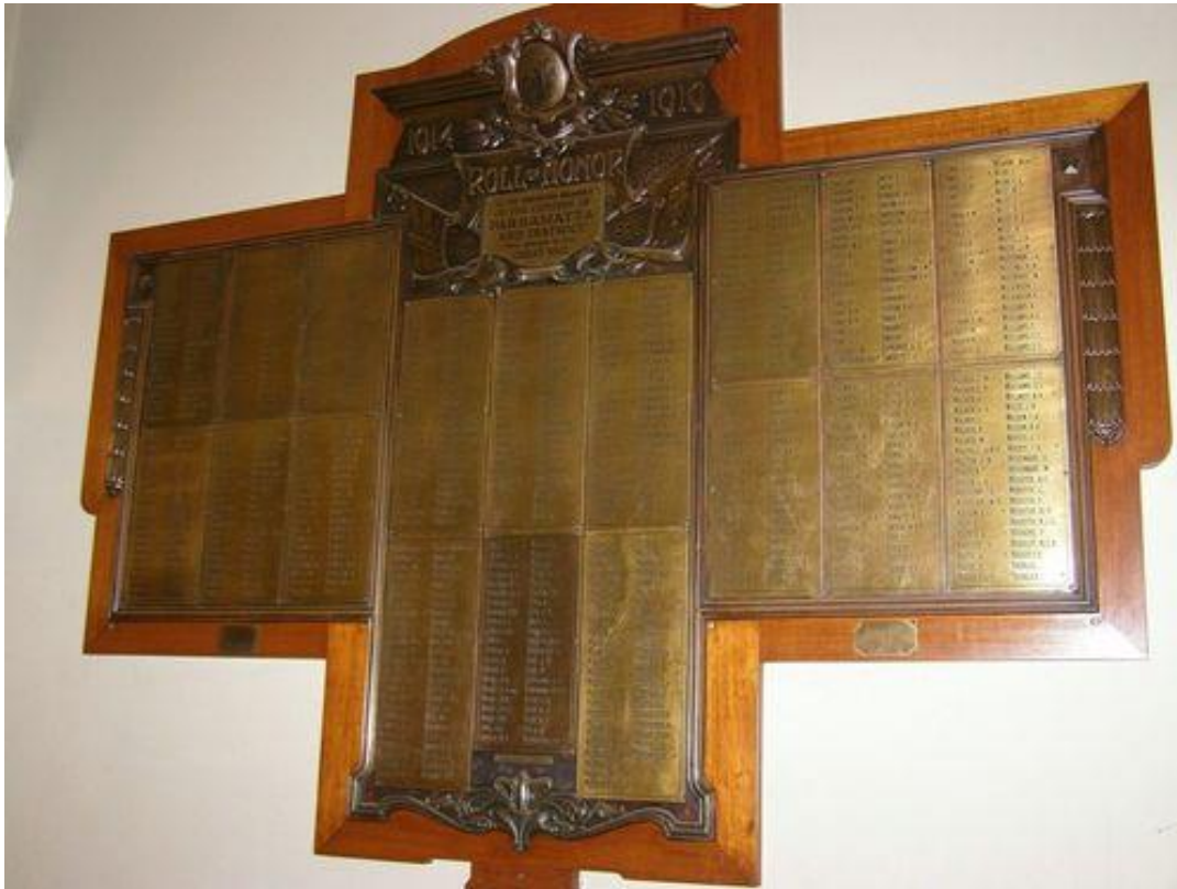
Parramatta & District Roll of Honour