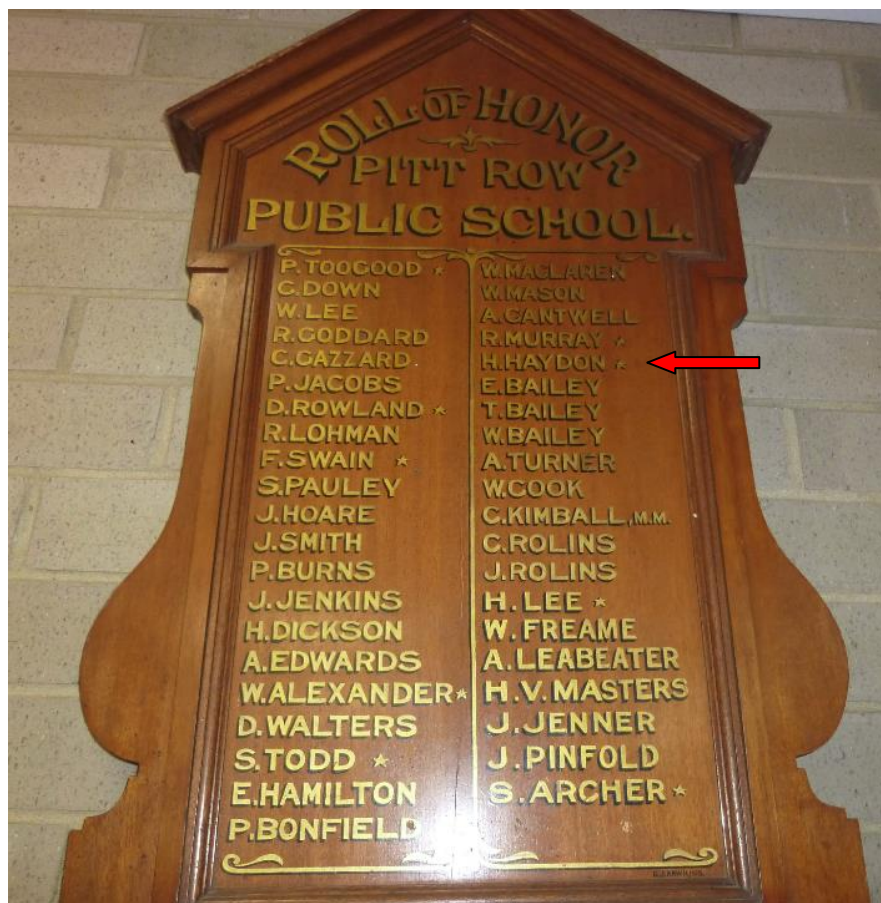
Pitt Row Public School Roll of Honour